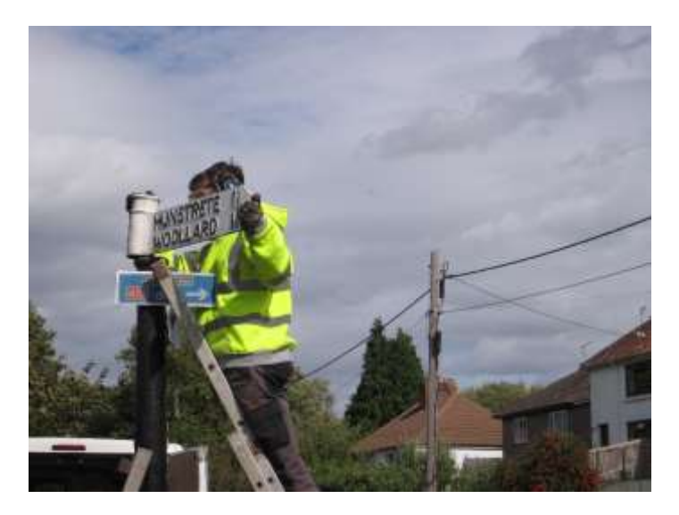
Last finger removed