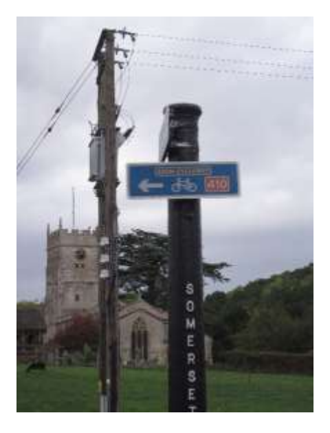
What was left behind