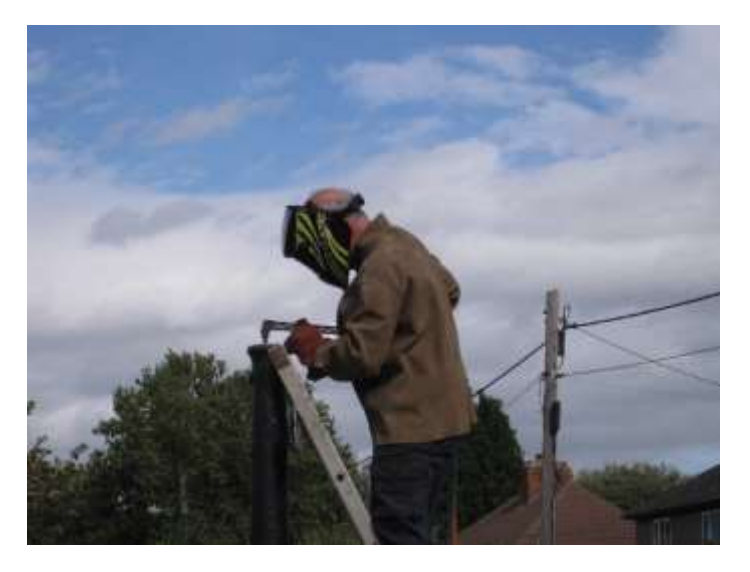
Gas cutting to remove the remains of the inner post