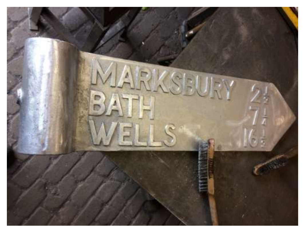
The brand-new finger