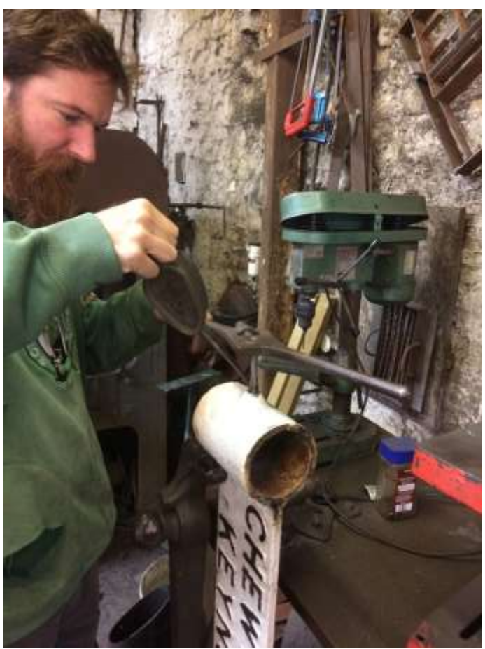
Restoration work of an old finger